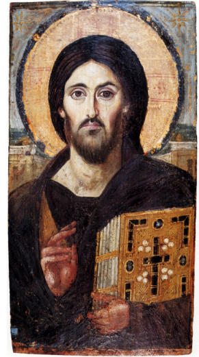
Christ Pantocrator - St. Catherine's Monastery (6 th century, Sinai)

Grant me, O Lord my God, a mind to know you, a heart to seek you, wisdom to find you, conduct pleasing to you, faithful perseverance in waiting for you, and a hope of finally embracing you. Amen.