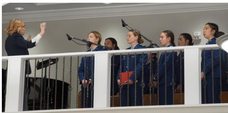
Air Force Academy Choir