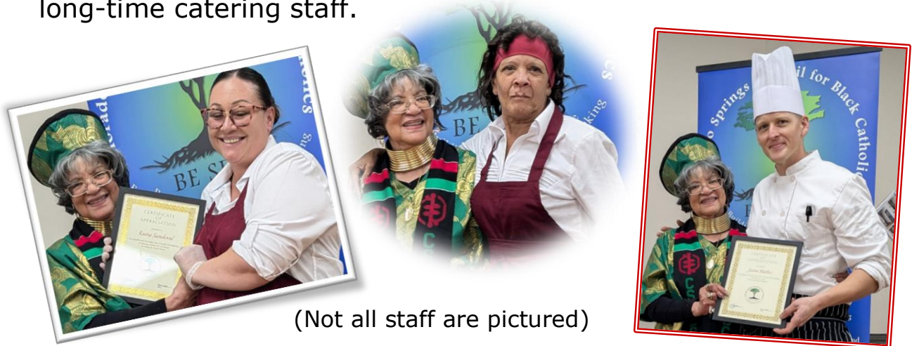
(Not all staff are pictured)

Certificates of Appreciation were also presented to our long-time catering staff.