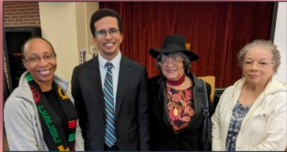
Members with speaker (second from left)

Some members attended the presentation "People of Action: Black Catholics on the Road to Sainthood" sponsored by Colorado College.